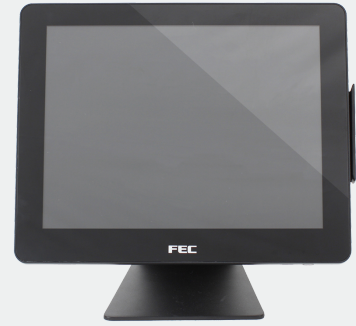
Side USB I/O for Add-on Devices