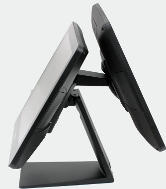
AerArm with 2nd Display