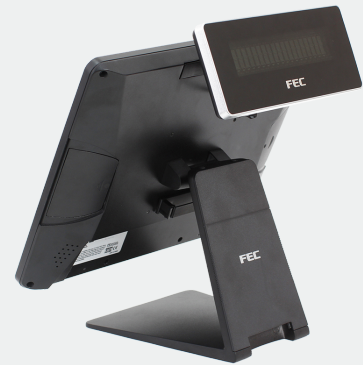
Intergrated Customer Display